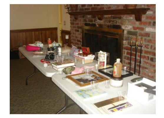
Goodies, goodies, goodies! All for the May 2009 Buffalo Auction.